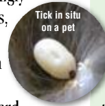
Tick in situ on a pet

Please come and see us for a pre-hibernation check up!