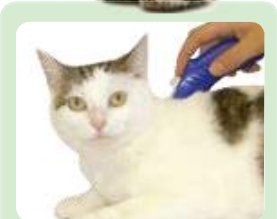
A tiny microchip is easily injected under the skin.