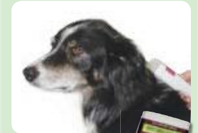
A special scanner is used to "read" the unique I.D code. This code speedily identifies your pet.