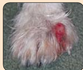
Paw of a dog with an interdigital cyst caused by a grass seed