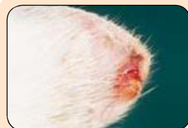
Ear tip of a cat showing cancerous changes

When out on walks it is important to avoid ponds that may contain dangerous algae,