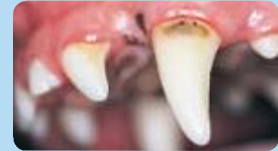
(b) Gingivitis – with early calculus