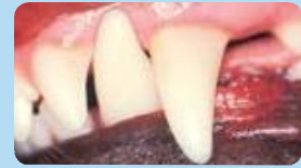
(a) Healthy mouth

Unfortunately once a tooth becomes loose, the problem has usually progressed too far to save that tooth. However if gum problems are identified at an earlier stage, a combination of a Scale and Polish and ongoing Home Care can make a real difference to your pet's oral health (and also their breath!). Please contact us today for further details!