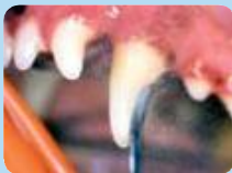
Removing the calculus using an ultrasonic scaler, followed by polishing the teeth is a very effective form of treatment

A healthy mouth typically has bright white teeth and shrimp pink (or sometimes pigmented) gums. However plaque bacteria are constantly accumulating on the surface of their teeth and will, in time, lead to inflammation of the gums – a condition called gingivitis . Affected gums are more reddened in appearance, and these changes may also be associated with localised mineralisation of the plaque to form calculus (tartar) – see picture (b).