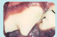
Healthy mouth with white teeth and healthy pink gums