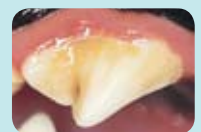
Unhealthy mouth with gingivitis and calculus