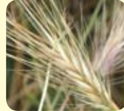
Grass awns of the summer grasses