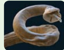
Adult A. vasorum lungworm These live in the heart and pulmonary arteries

Lungworm infestation, caused by the parasite Angiostrongylus vasorum is something that all dog owners should be aware of. Angiostrongylus vasorum can cause a wide range of symptoms – some severe, including coughing, lethargy, fits and blood clotting problems. However other pets may show no obvious signs of problems.