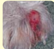
Paw of a dog with an interdigital cyst caused by a grass seed